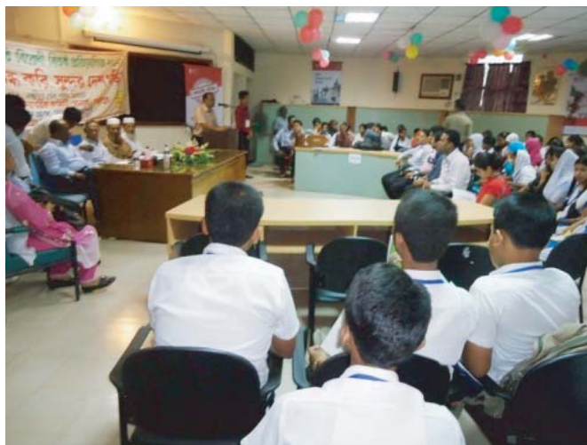
Anti-Corruption Debate Competition in Laxmipur

CCC-Laxmipur organized a daylong Anti-Corruption Debate Competition in Laxmipur Zila Parishad Auditorium on June 27. 'Corruption is the main barrier for development' was the theme