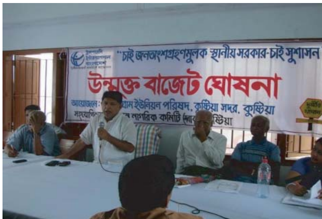
Open budget declaration event at kustia

Kustia: On June 22, a Face the Public & open budget declaration event was organized in Uzangram Union Parishad of Kustia. Among others Chairman of the Union Parishad, Members, local elites, Journalists, representative of NGO and general people of the locality attended. Secretary of the Uzangram Union Parishad announced the