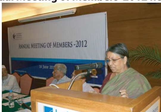
Chairperson of TIB's Board of Trustees at AMM 2012

The members of TIB made a call to build the country with the spirit of independence war. They also emphasized on to strengthen the anti-corruption movement for