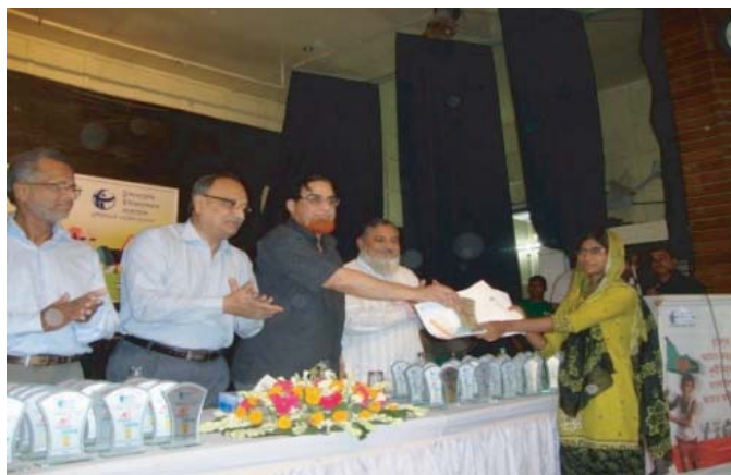
Reception programmes for the GPA-5 holders in the S.S.C 2012

Reception programmes for the GPA-5 holders in the S.S.C examination 2012 were held in different CCC areas to encourage the new generations in anti-corruption movement. Those receptions were held on 30 June in Muktagacha and