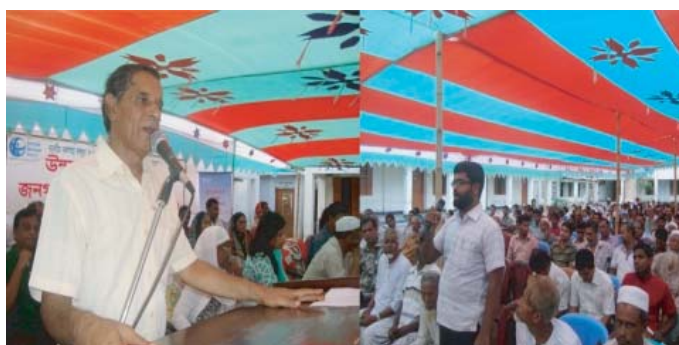
Face the Public and Open Budget Declaration at pirojpur

Barguna; on 26 June Gazipur, on 24 June Chandpur, on 22 June Laxmipur, on 19 June Munshiganj, on 17 June Comilla, on 15 June Nilfamari, and on 14 June Dinajpur. Members of Parliament, Deputy Commissioner, Additional Deputy Commissioner, Upazila Parishad Chairman, Mayor of Municipality, Upazila Nirbahi Officer, District Education Officer, Teachers, students, Guardians, Civil society members and media personality participated in these receptions where a paper has read out for the students who also took the anti-corruption oath.