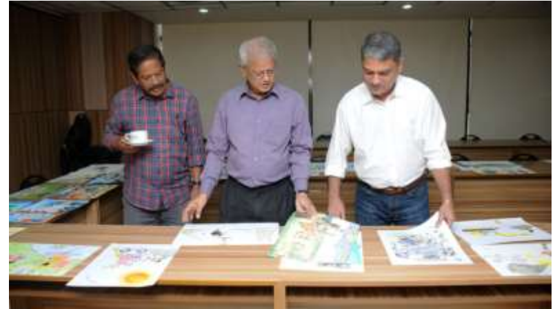
Judges Screening the Cartoons

Cartoonist & Executive Editor, The Business Standard.