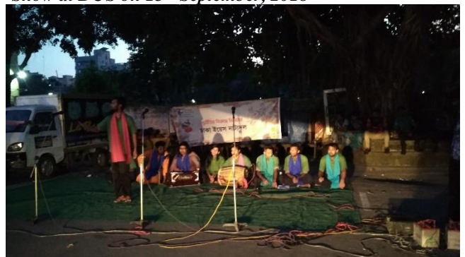
Show at Rabindro sarani, Uttara on 16th September, 2018

As part of an anti-bribery campaign, Dhaka YES theatre group displayed number of performances in different areas of Dhaka launching a new Drama titled "Chiching faq" which visualized irregularities especially while implementing programmes in the field of education and health. The drama concluded with message to mass people to change their beloved country through raising their voice against corruption. The total of four shows were staged at Hall lounge, Ruqayyah Hall on 10 September; DUS, TSC; and Diyabari and Rabindro Sarani, Uttara on 13<sup>th</sup> September, 16<sup>th</sup> September 2018 respectively.