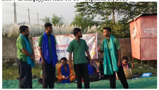
Show at Diyabari, Uttara on 16th September, 2018