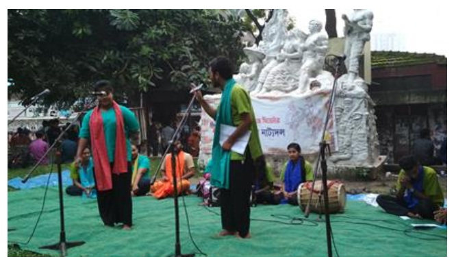
Show at DUS on 13th September, 2018