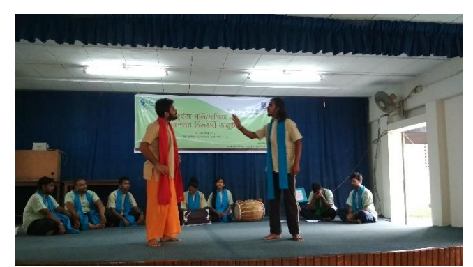
Show at Ruqayyah hall on 10th September, 2018