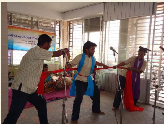
Theater show at Uttara University

Dhaka YES theatre group continues to disseminate anti-corruption messages portraying irregularities such as violation of law and human rights, wrongdoing in the health, education and climate finance sectors regarding governance issues. In the month of May, 2017 the group performed its production titled Swapner Swades swapno noi sambhab in the campuses of Jahangirnagar University and Uttara University on 22 nd and 24 th May respectively. The drama carries strong messages for the concerned authorities focusing the corruption taking places in public service delivery and the helpless condition of sufferers which are absolutely wrong. The drama concludes with strong urge to improve the prevailing situation and calls people to raise their voice against the corruption in the spirit of historical achievement of mass people in 1971 and 1952.