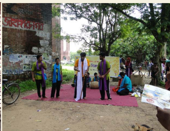
Theater show at Jahangirnagar University

As part of TIB's variety of campaigns to aware and engage people in the fight against corruption, Dhaka YES theatre group produces thematic drama shows highlighting inequality, wrongdoing,