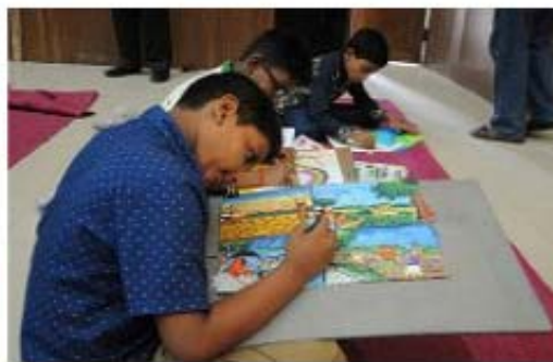
Best Artworks of the competition

In the morning, a total of 68 students participated from 29 schools in two categories as group A, class 6-8 and group B, class 9-10 took part in the competition organized at the Bangladesh Shishu Academy (BSA) premises in Dhaka. The artists did their artwork on “Amar Shwapner Bangladesh o Jalbayu Paribartan (Bangladesh-My Dream: Climate Change)”.