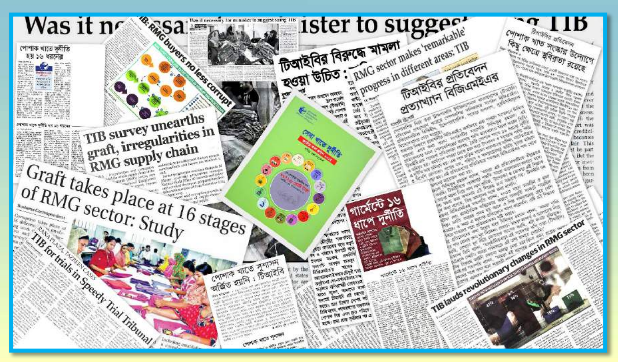
Collage containing Media Coverage of TIB study release

Another follow-up study titled 'Good governance in the ready-made garments sector: Achievements, challenges and way forward 'assessed improvement and the implementation status of different initiatives and efforts undertaken to ensure the sector's good governance from April 2015 to March 2016. The earlier two studies conducted in 2014 and 2015 identified that 34 initiatives were fully implemented. Thus, current study reviewed the progress of remaining 68 initiatives in the last one year. It was found that 12% initiatives (8) were fully implemented, 53% initiatives (36) made satisfactory progress, 16% initiates (11) slowly progressed and 19% initiatives (13) didn't progress.